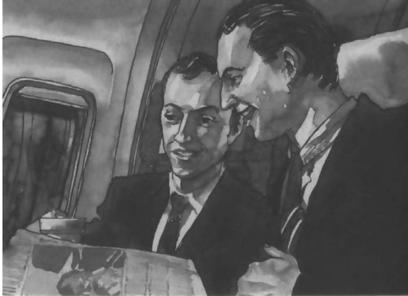
'I'm just a police officer.'